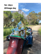
fav days @ravage day